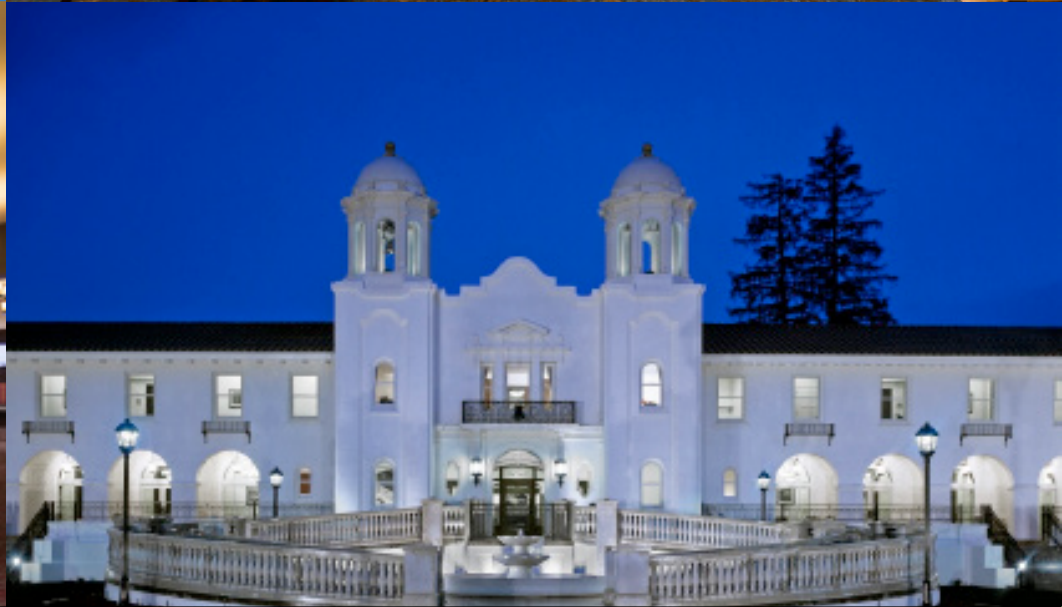
SARATOGA RETIREMENT COMMUNITY Saratoga, CA