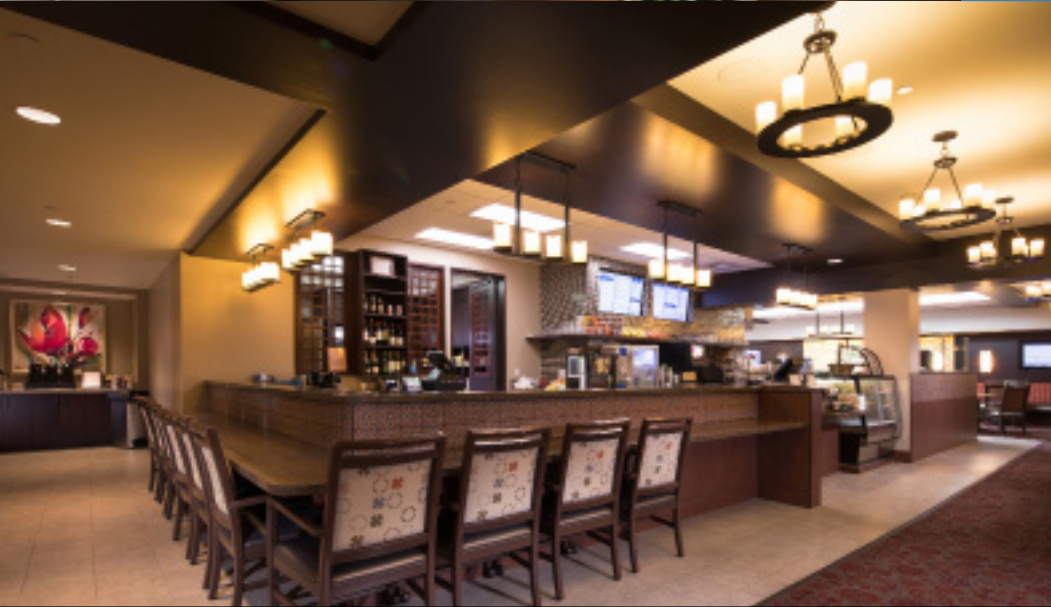
CASA DE LAS CAMPANAS San Diego, CA