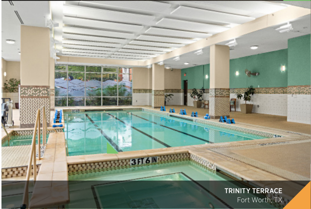
TRINITY TERRACE Fort Worth, TX