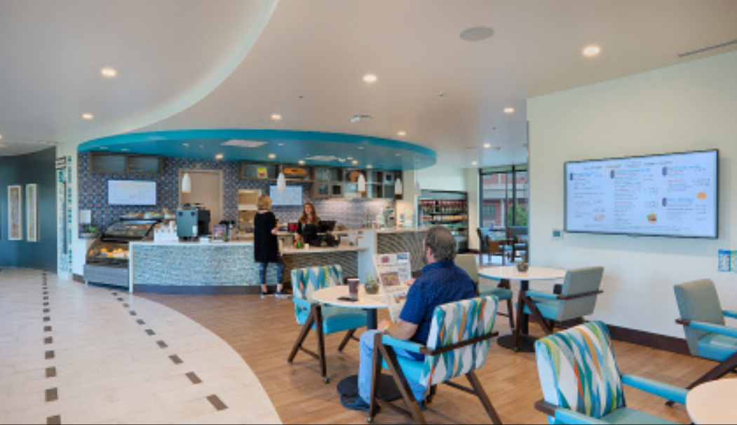
SAN FRANCISCO CAMPUS FOR JEWISH LIVING San Francisco, CA