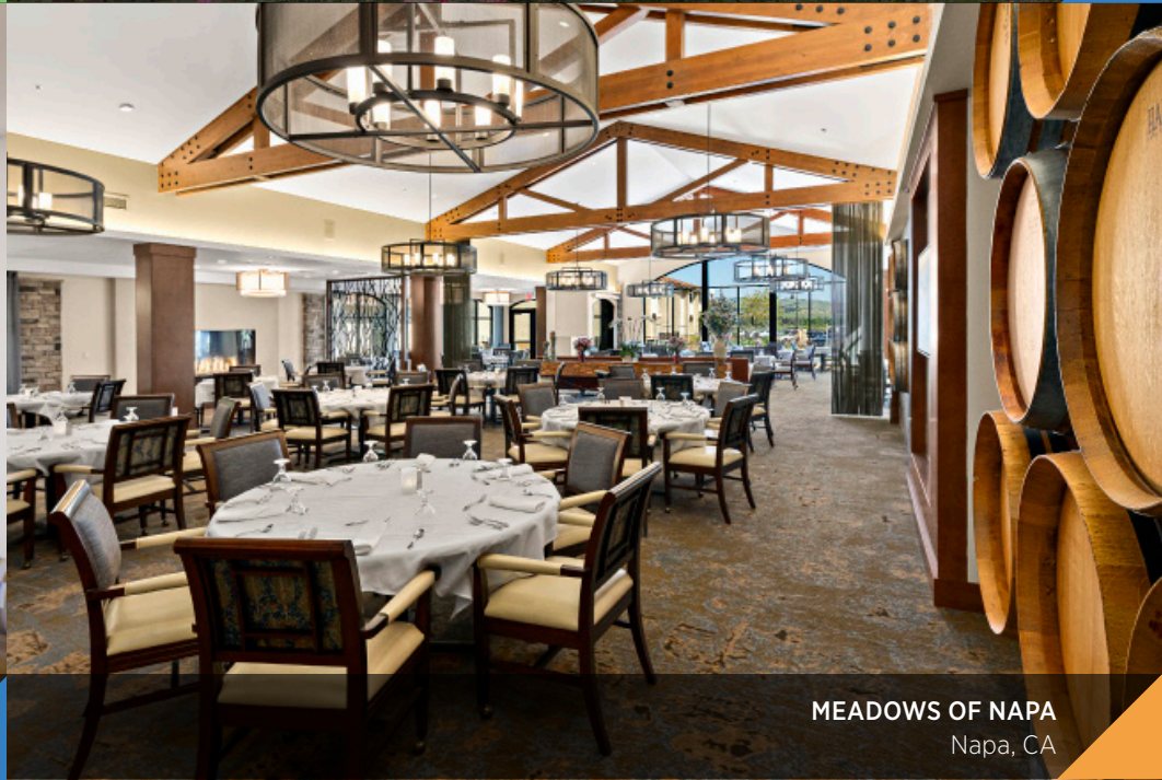
MEADOWS OF NAPA Napa, CA