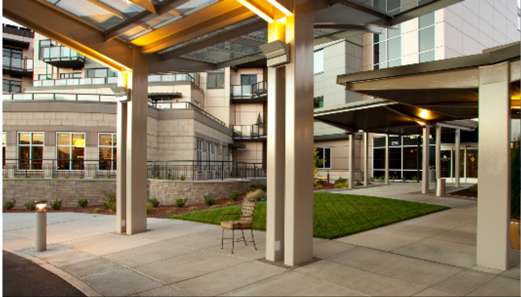
ROUGE VALLEY MANOR Medford, OR