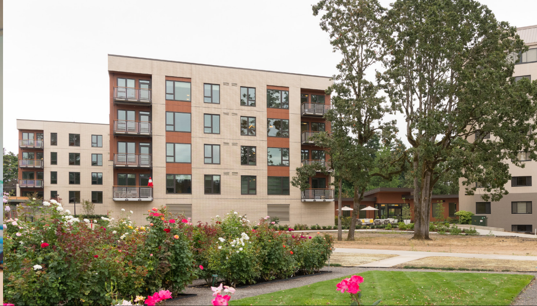
WILLAMETTE VIEW Portland, OR