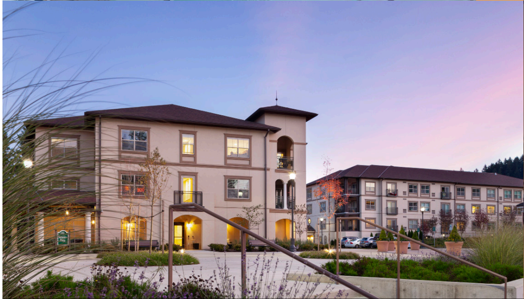
MARY'S WOODS Lake Oswego, OR