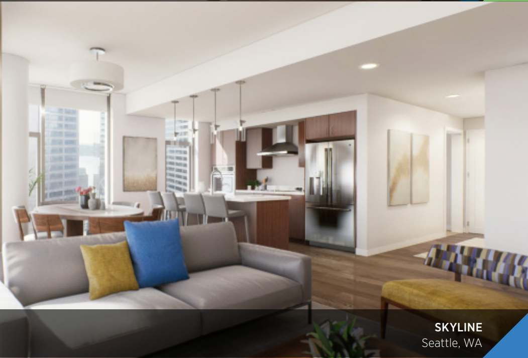
SKYLINE Seattle, WA