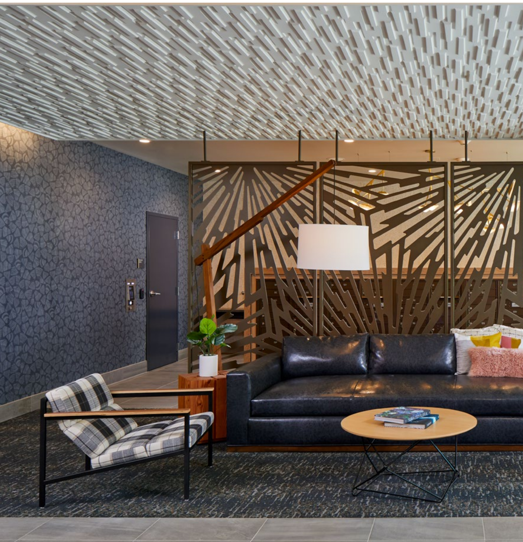
Design for Living: Mid-Rise