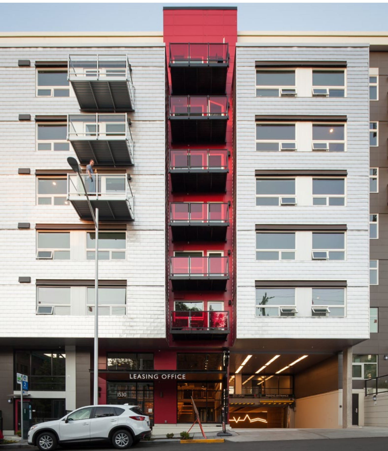
Design for Living: Mid-Rise